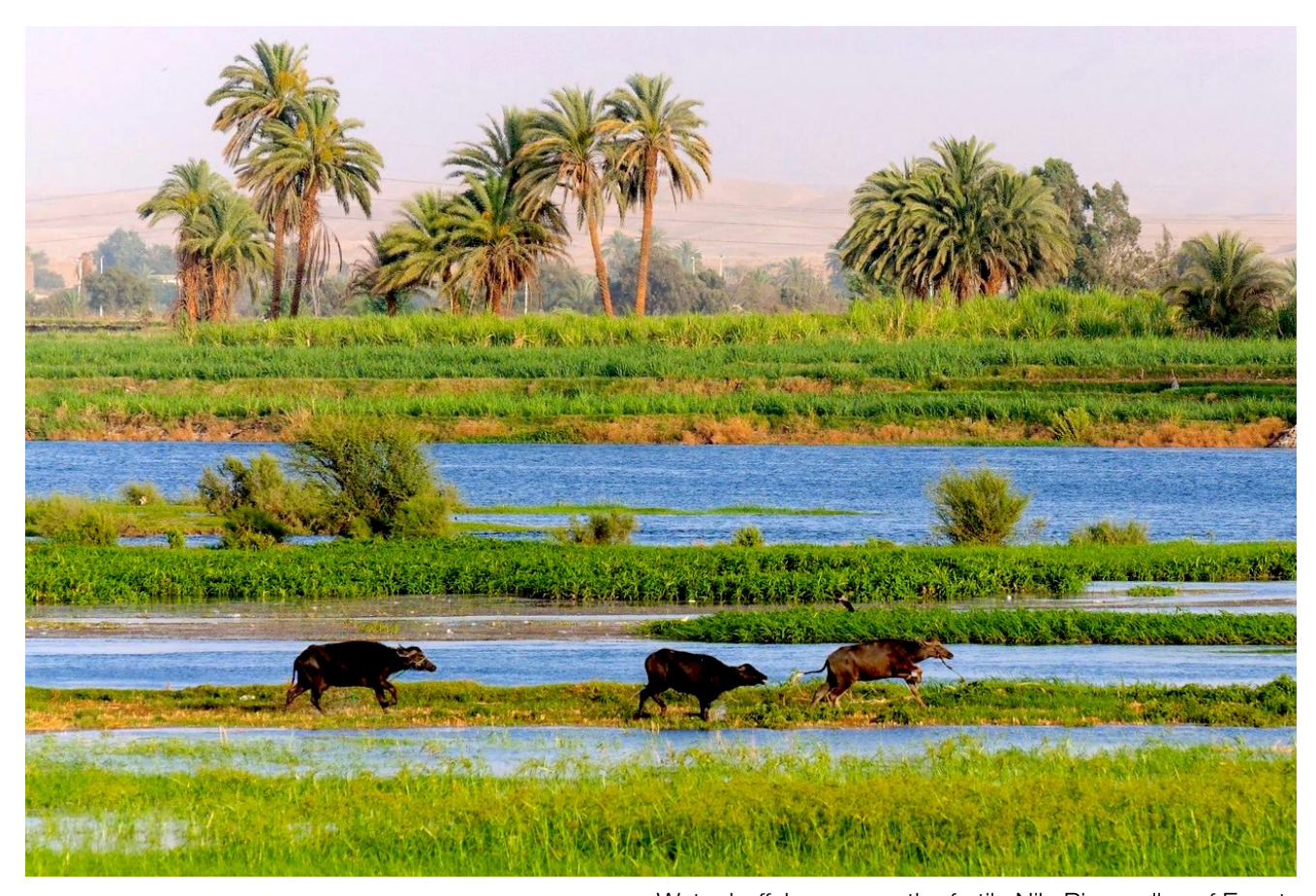
Water buffalo oxen on the fertile Nile River valley of Egypt